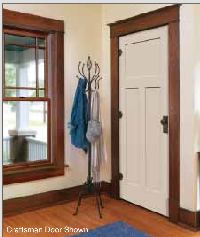
Craftsman Door Shown

Old European architecture made for traditional styling, Executive Series offers a sense of depth to every door.