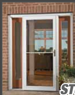
STORM & MORE!